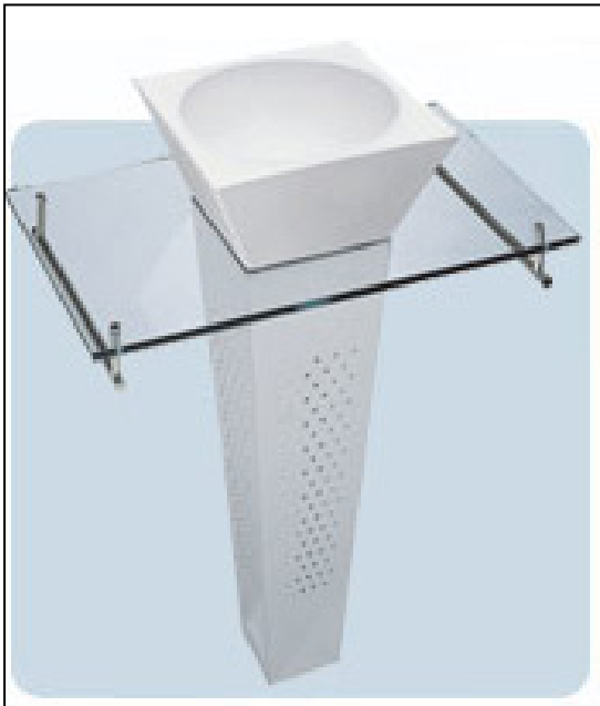
LAVAMANOS DE SOBRE MESA